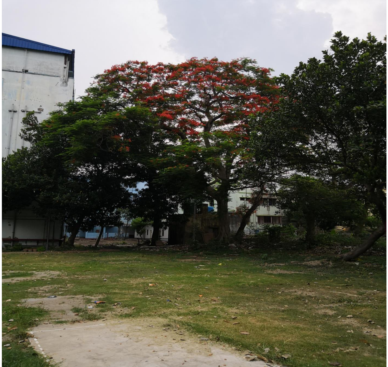
College Campus Tree