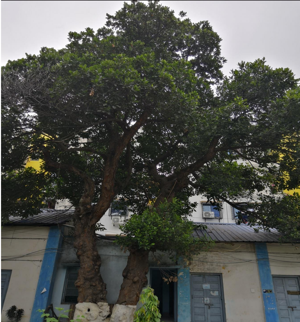
College Campus Tree