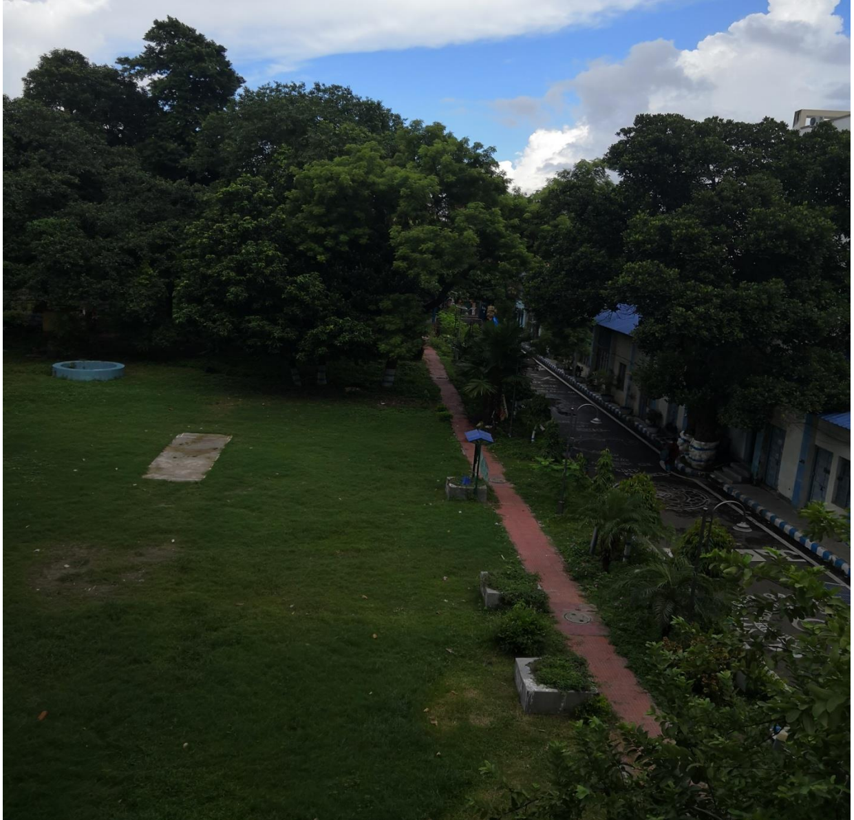
Landscape of College Campus