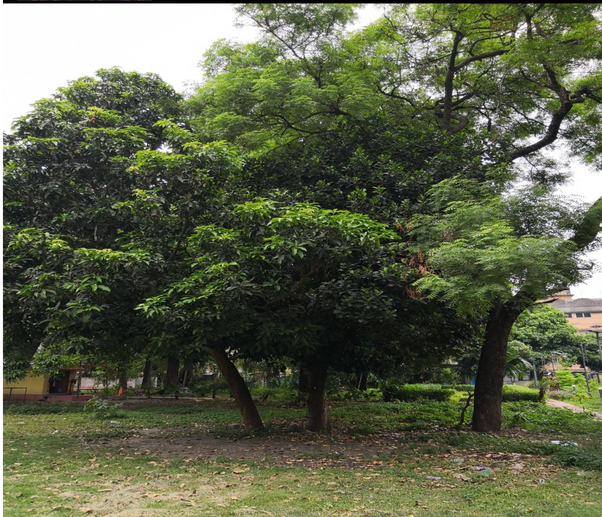
College Campus Tree